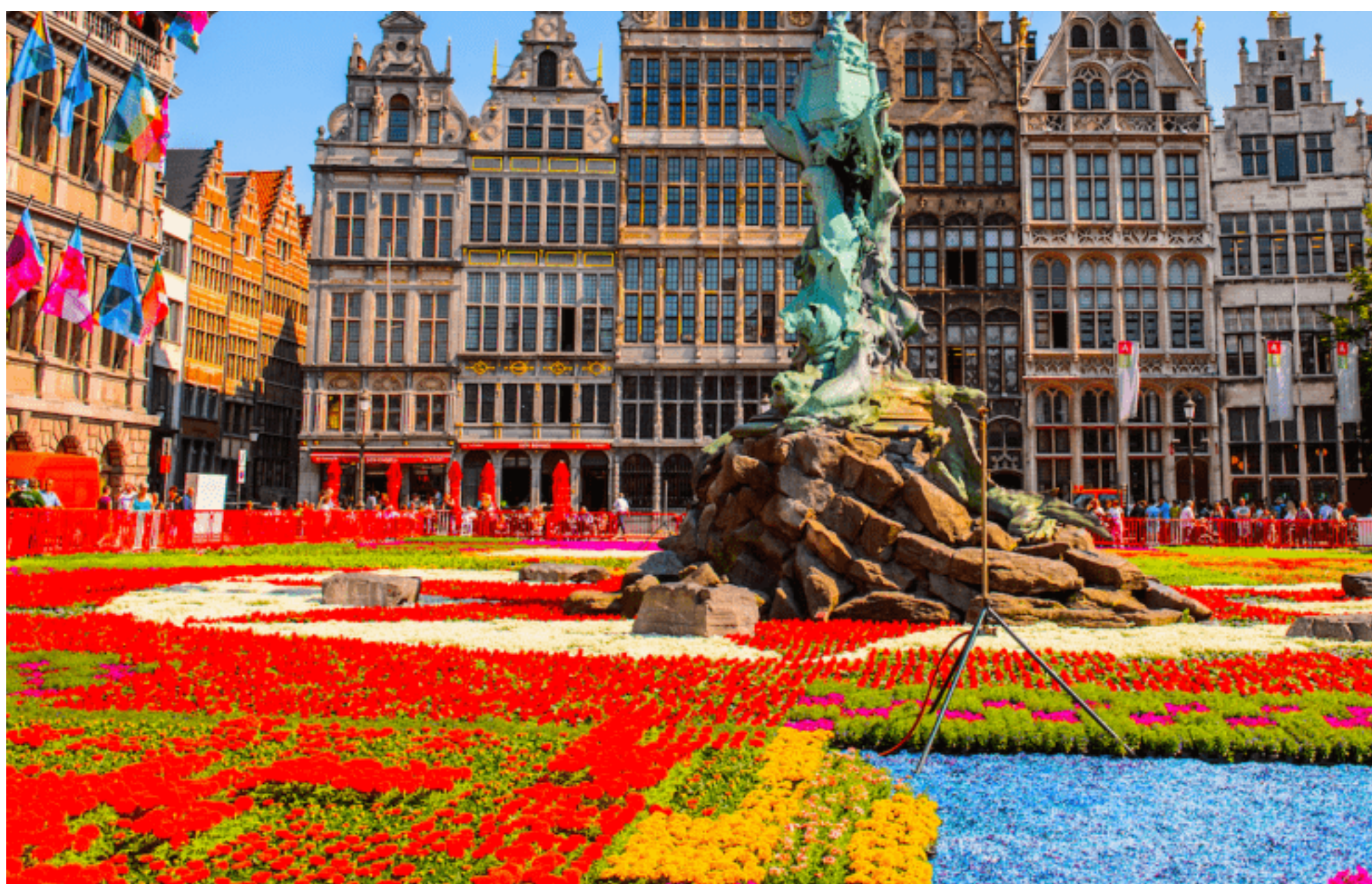
The City of Brussels