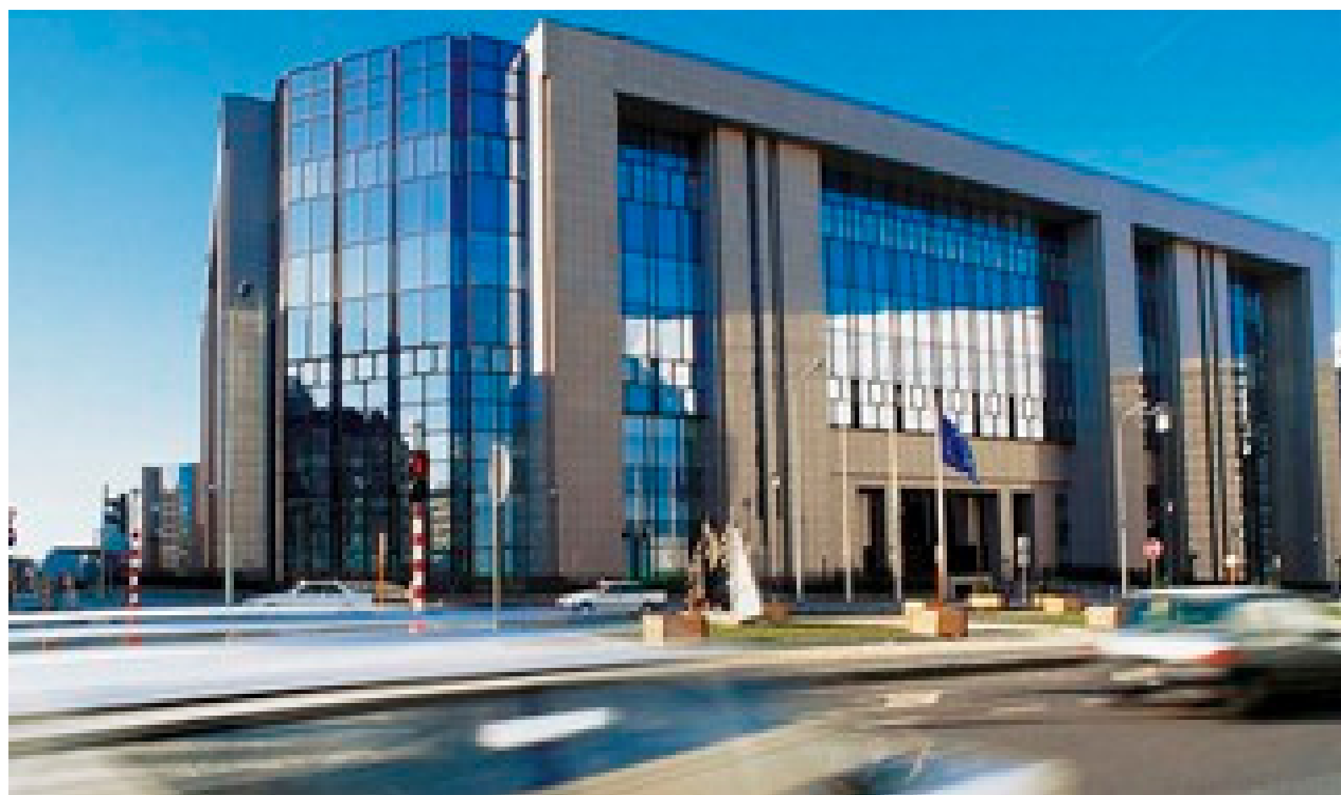
The Council of the European Union