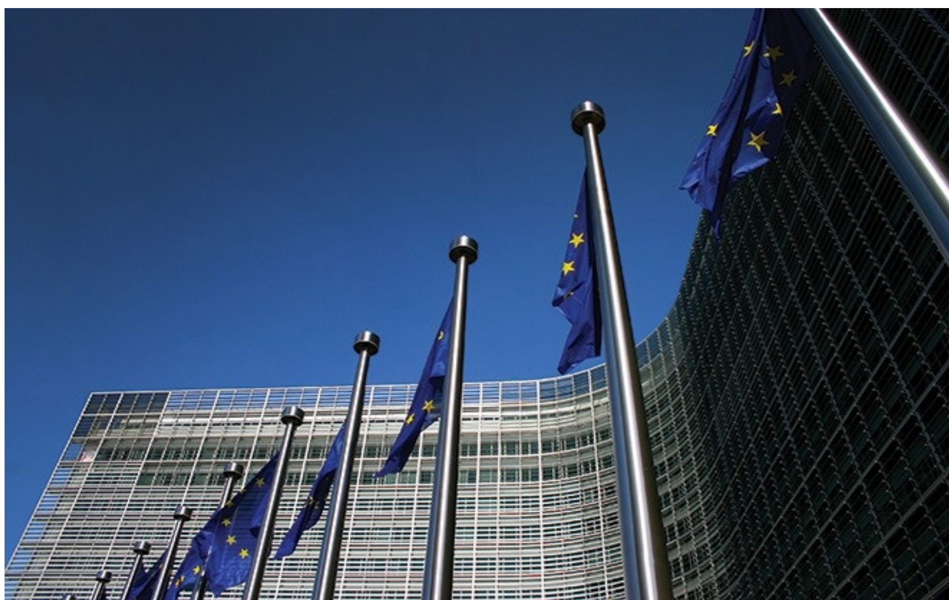
The European Commission